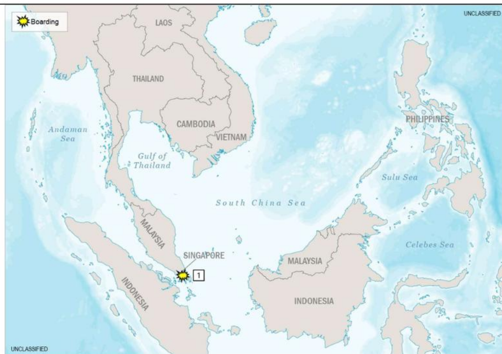
(U) Figure 1. Piracy and Armed Robbery at Sea in Southeast Asia